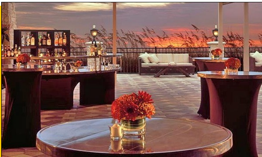
Outdoor veranda of the Azurea Lounge

Attendees may also book their stay online through a customized IMF Link.